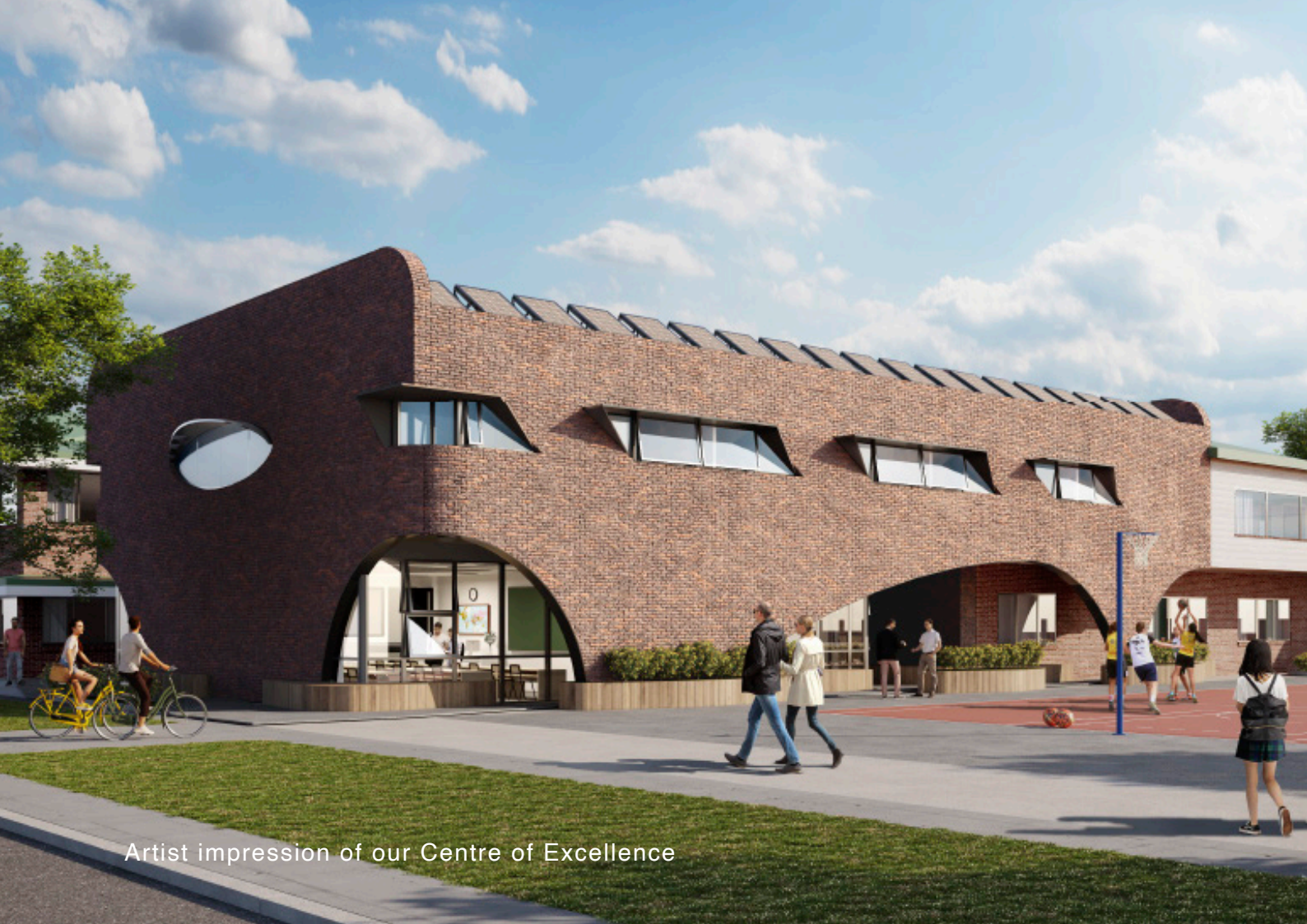
Artist impression of our Centre of Excellence